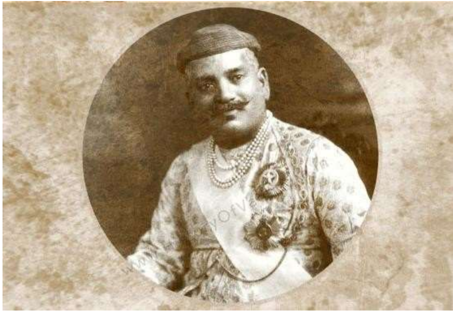
H. H. Maharaja Sayajirao Gaekwad-III