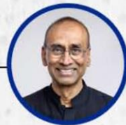
Invited Speaker Prof. Venki Ramakrishnan MRC Labs, Cambridge University, UK (Nobel Laureate and Padma Vibhushan Awardee)