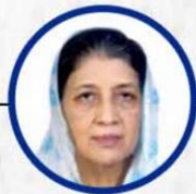
Guest of Honor Rajmata Subhanginiraje Gaekwad Hon'ble Chancellor, The MSU, Baroda

Lecture Topic: “My adventures in the Ribosome”